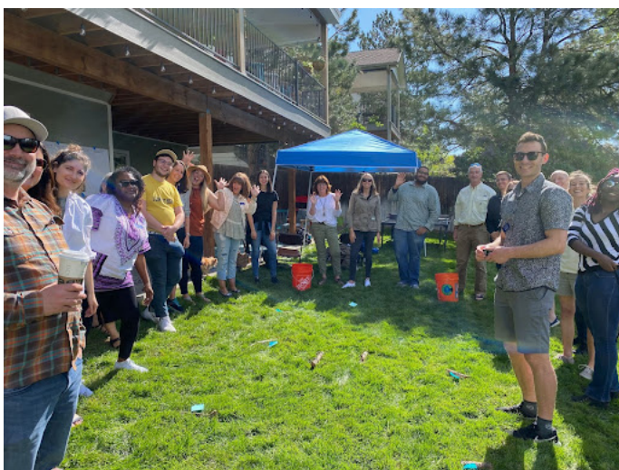
GSN Staff Gather for an In-Person Staff Retreat in May 2021

Generation Schools Network (GSN) is proud to announce the release of our 2020-2021 Annual Report, Pivoting Toward Potential .