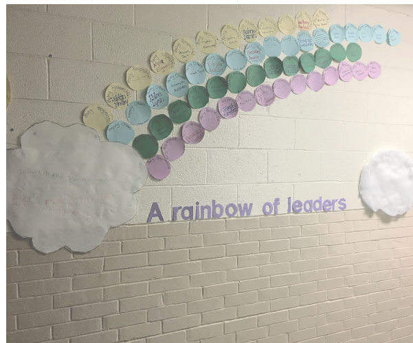
Eckhart Elementary celebrates their student leaders through BPEG.

Eckhart is incorporating SEL and Bullying Prevention professional development for teachers throughout the year.