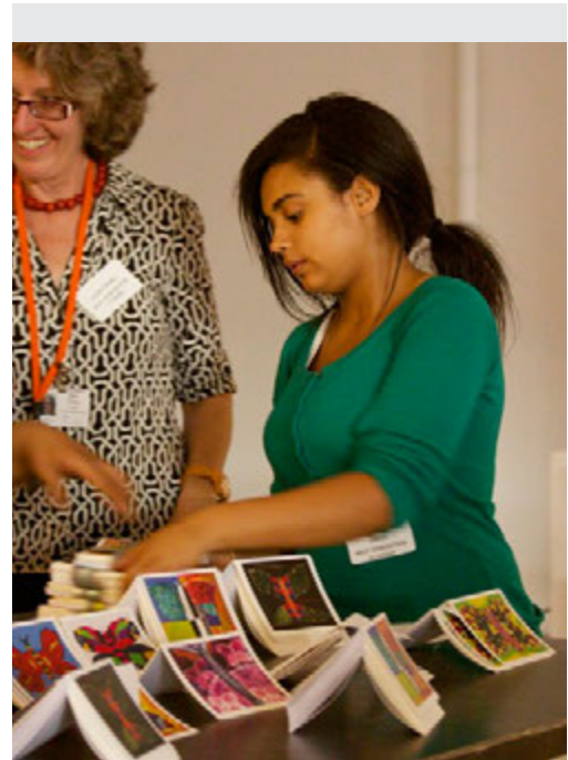
A student entrepreneur sells cards at a reception for Community Engagement Team members in Denver. During her Arts & Digital Media Intensive, her venture team developed a business plan for a card company, designed, produced, marketed, and sold the cards for a profit with some money reserved for charity.

Scaffolding low-income students into the workforce has been a persistent challenge. In his book, Outliers: The Story of Success , Malcolm Gladwell describes a study launched in 1921 by Dr. Lewis Terman, a Stanford University psychologist and pioneer of the IQ test. Terman identified more than 1,500 students who scored 135 or better on the Stanford-Binet exam and tracked their careers into their eighties. He found that many students from under-resourced backgrounds, despite their genius, failed to live up to any standard measure of success.