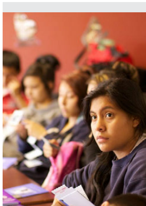
Students visited Denver Workforce Center to learn about resume writing and summer job opportunities.

This type of support is critical. According to author Paul Tough, "An emerging body of research shows...that what matters most in a child's development...is not how much information we can stuff into her brain in the first few years. What matters, instead, is whether we are able to help her develop a very different set of qualities, a list that includes persistence, self-control, curiosity, conscientiousness, grit, and self-confidence. Economists refer to these as non-cognitive skills, psychologists call them personality traits, and the rest of us sometimes think of them as character." 17