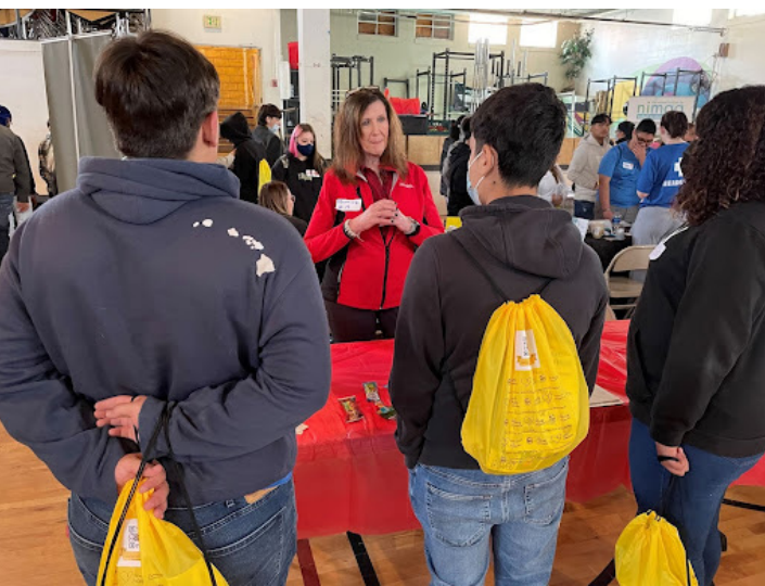
Students learn from a local employer about summer job opportunities!

Every partnership opportunity we approach is unique. We believe the key to any successful relationship involves identifying each other's assets, abilities and goals, and seeing where areas overlap and what opportunities arise.