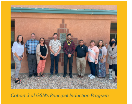
Principal Induction Program Expands Reach

Principals are often left out of development opportunities, and this is especially true for principals in small rural and charter schools who need to move from an initial principal license to a professional license. To help address this inequity, GSN diversified the schools served in its Principal Induction Program, resulting in three rural and five charter principals receiving professional licensure.